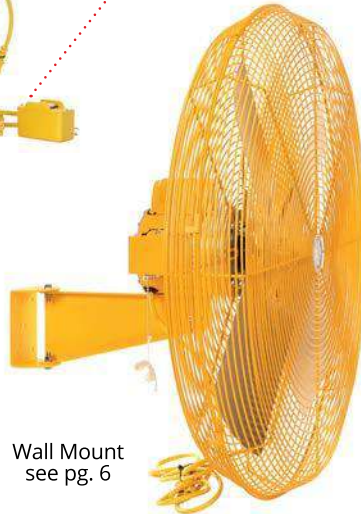
Wall Mount see pg. 6