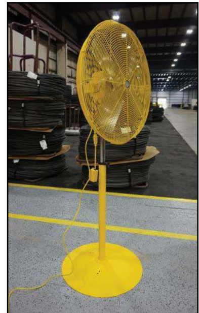
Pedestal Mount, see pg. 6