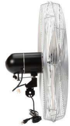
ACH-O Series Oscillating Motor