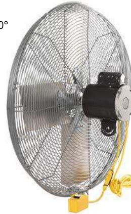
HDH-G-JR Series Drop-Down Plug and Hinged Guard