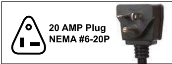
20 AMP Plug NEMA #6-20P